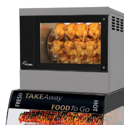
Space Saver TG 4