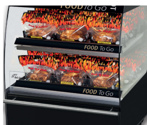
MD 86-2 self serve heated merchandiser

* see separate spec sheets for more information on the 4- and 5-spit rotisseries