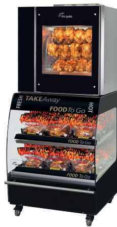
Space Saver TDR5 P

The rotisserie's appetizing chicken theatre will whet the appetite of any customer. The fact that customers can take the products from the MDS 86-2 themselves will lower buyer thresholds even more. Double output on a single spot. Success guaranteed!