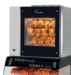
Space Saver TDR5 M